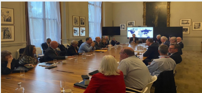
U.S. and U.K. delegates and represented U.S. engineering licensing boards discuss details of the proposed Mutual Recognition Agreement at the Foreign, Commonwealth and Development government offices in London.